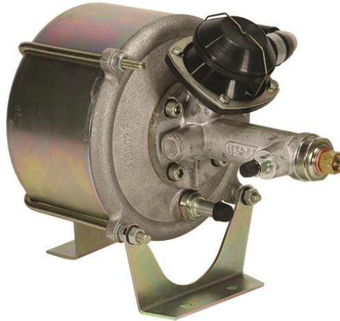
BS1010K – Remote Brake Booster

Thanks for your purchase of our Single Diaphragm Remote Brake Booster. This is a universal brake booster for use when a power brake system is desired but the room under the hood doesn't allow for any kind of master cylinder mounted brake booster. This booster is designed to be used on vehicles with front disc brakes and rear drum brakes. The booster can be mounted almost anywhere in the vehicle including areas as far away as the trunk.